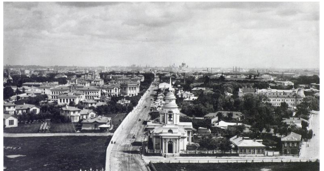
University clinical campus on the Devich'e Pole (view from the bell tower of the Novodevichy Convent)