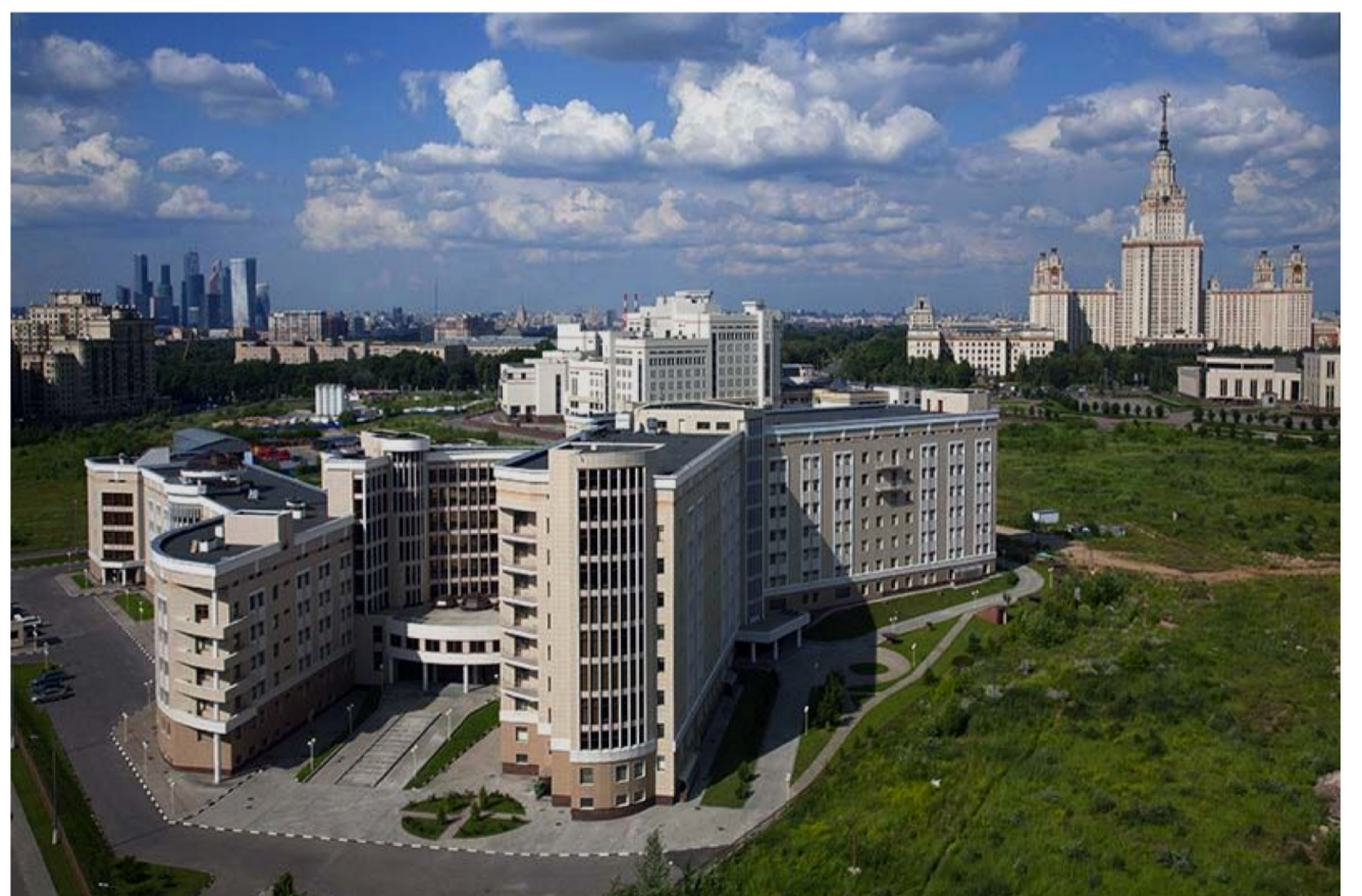
Lomonosov University Clinic (nowadays)