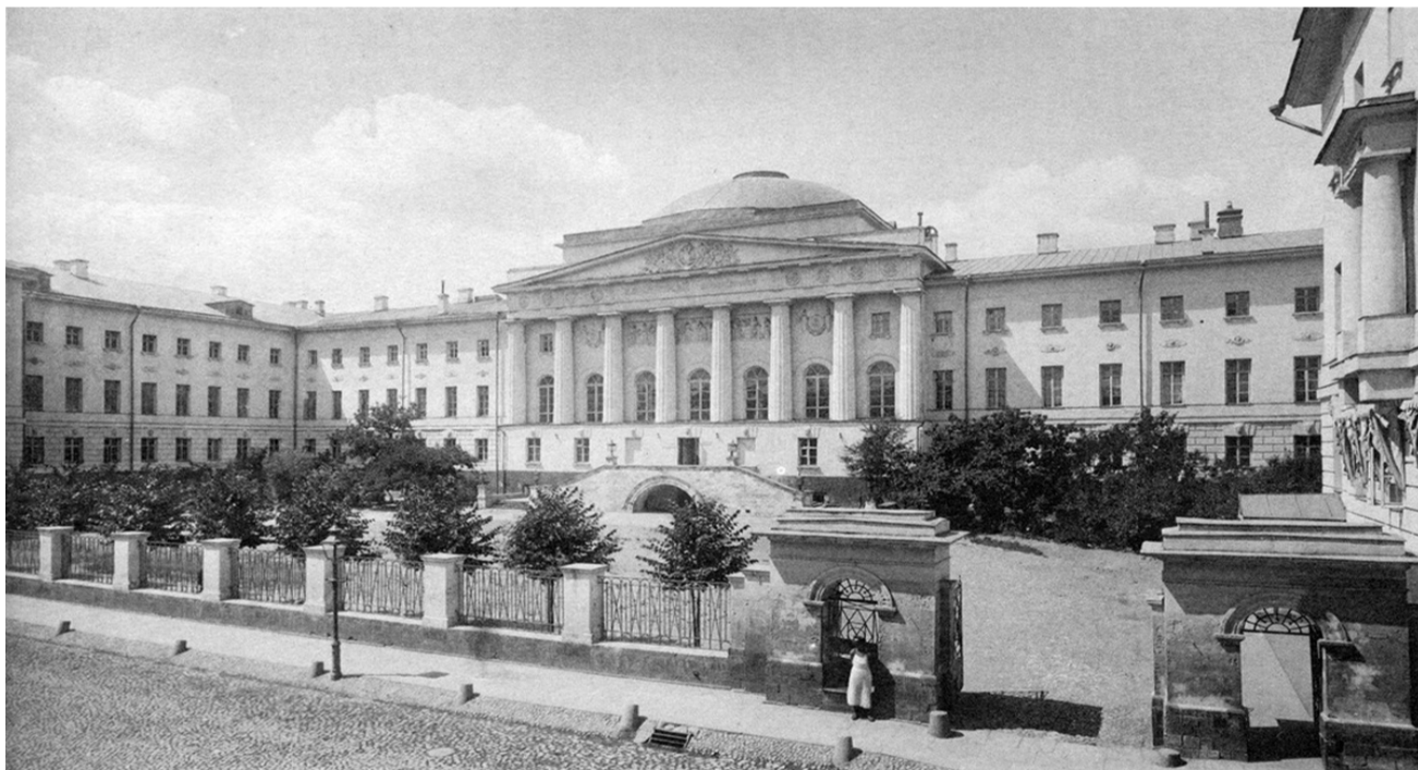
Old building of Moscow University on Mokhovaya street

The University Clinic has qualified specialists and modern equipment. Biopsy and surgical materials, modern histological, histochemical, immunohistochemical, molecular, genetic, ultrastructural methods are widely used both for education and science purposes which ensures the implementation of the unity of education, science and clinical practice.