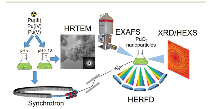
Fig. 1 The schematic illustration of the research methodology applied to PuO2 NPs studies. PuO2 NPs synthesized from different precursors (Pu(III), Pu(IV) and Pu(V)) and at pH 8 and pH > 10 were analysed with HRTEM and various synchrotron techniques (EXAFS, XRD, HEXS and HERFD).